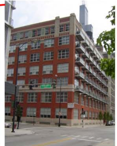
333 S. Desplaines Street